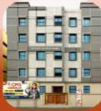
JNTU METRO 97011 00339