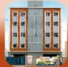
DILSUKHNAGAR 95739 93399