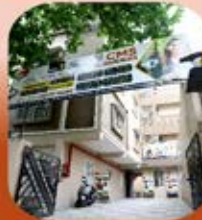
SECUNDERABAD 95739 94499