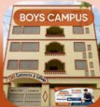
BOYS CAMPUS SR NAGAR Boys Campus 95739 96699