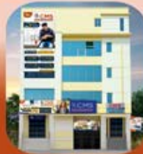
ECIL 95151 51326