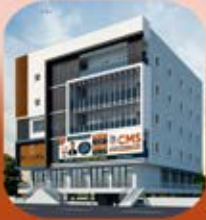
CHANDANAGAR 79979 98049